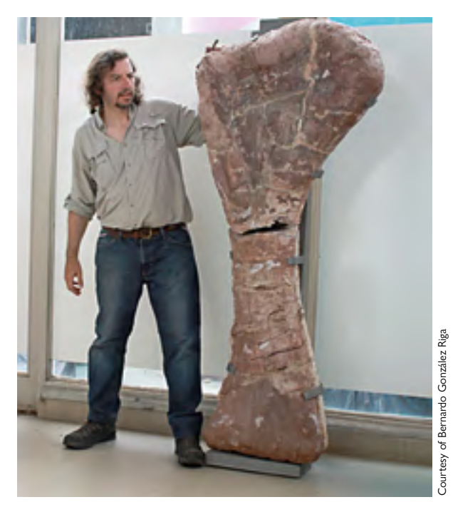
Figure 9. Holotype of the humerus of Notocolossus gonzalezparejasi . This is the longest titanosaur humerus in the world to date, at 176 cm.

Establishing which is the largest titanosaurid from Argentina is quite difficult because only three taxa have relatively complete skeletons, and the rest are represented by isolated bones. The bestpreserved skeletons we have belong to Patagotitan, Dreadnoughtus, and Futalognkosaurus. Many attempts have been made to establish which is the largest titanosaurid, but there are still some doubts regarding the results. For instance, both Dreadnoughtus and Futalognkosaurus have similar size, 26 meters long, and a weight of approximately 30 tons, but Patagotitan weighed 52 tons (Paul, 2019). That means that Patagotitan would be 80% heavier than the other two: however, when we review the size of different bones, we do not see such difference. The largest bone differences of Futalognkosaurus and Dreadnoughtus with respect to Patagotitan are: humerus, 7 cm (5%); femur, 40 cm (21%); pubis, 15 cm (11%); anterior dorsal vertebra, 26 cm (23%);