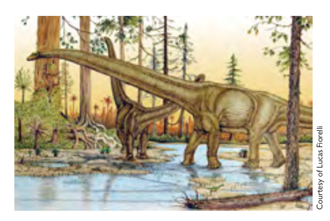
Figure 3. Representation of Argentinosaurus huinculensis. When the taxon was discovered in 1989, it was the world's most gigantic dinosaur, and remained so for almost two decades. It was estimated to weigh more than seventy tons.

Another fragmentary taxon is Traukutitan eocaudata (Juarez Valieri & Calvo, 2011) collected in 1990 by Dr. Calvo at Barreales lake, Neuquén province (Table 6). It was found 1000 meters away from the Futalognkosaurus site and on a different formation (Bajo de la Carpa Formation). The history