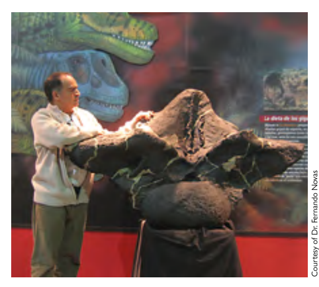
Figure 5. The anterior dorsal vertebra of Puertasaurus reuili (in the image, reconstruction of the holotype) is the largest ever found, at 168 cm wide. It probably belongs to the largest titanosaurid, but the scarce material collected prevents us from comparing it with other species, such as Argentinosaurus huinculenis.

«The larger the dinosaur, the less evidence we tend to find, because predators find big dead animals easily and destroy most of the body»