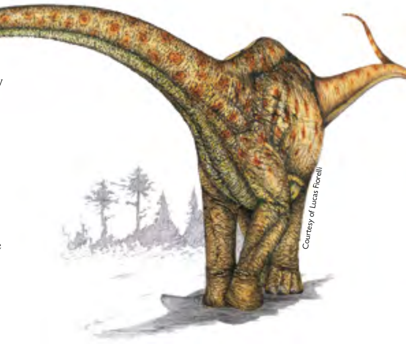
Figure 6. Representation of Futalognkosaurus dukei . The discovery of this species showed that titanosaurids with large femurs were neither the longest nor the largest.

Very recently a new giant titanosaurid sauropod was discovered at Chubut province (Figure 10; Table 9), the Patagotitan mayorum (Carballido et al., 2017). The taxon is represented by at least six different specimens, but based on the taphonomical, histological, and ecological data available, they were interpreted as belonging to a monospecific sauropod assemblage (Carballido et al., 2017). The longest bone is the femur (238 cm), 7 cm larger than Antarctosaurus , which is the main reason this taxon was supported as one of