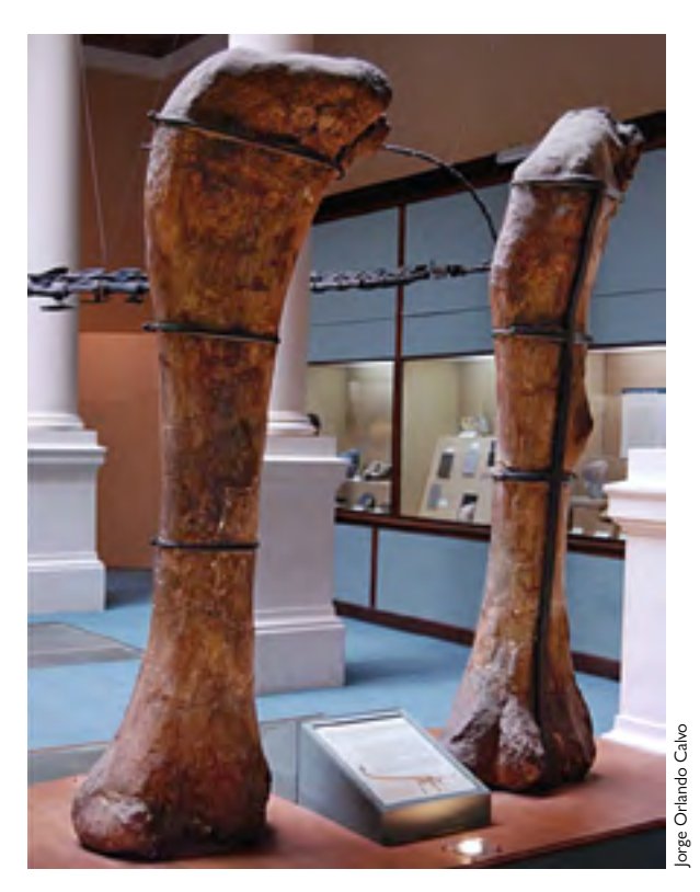
Figure 2. Holotype of Antarctosaurus giganteus in the La Plata Museum (Argentina). This species would have been one of the largest sauropods, with a body weight of about 69 tons.

In 1989 a paleontological team including Dr. Jose Bonaparte and Dr. Jorge Calvo of the National University of Comahue and Dr. Leonardo Salgado from the Cipolletti Museum excavated one of the largest titanosaurid sauropods (Figure 3) from the Huincul formation – probably, the most famous around the world, Argentinosaurus huinculensis (Bonaparte & Coria, 1993). It was discovered by a local farmer 5 km east of Plaza Huincul city, Neuquén Province (Table 3). The longest bone is the fibula (155 cm) described originally as a tibia. The widest neural arch on anterior dorsal vertebra is 126 cm wide (Figure 4). At the time the taxon was discovered, it was the largest dinosaur in the world and it was ruled