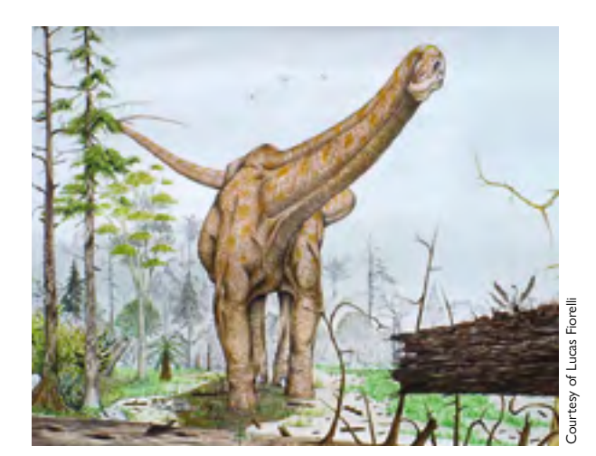
Figure 8. Representation of Traukutitan eocaudata . The size and weight of this dinosaur could be close to 30 metres and 30 tons, similar to Futalognkosaurus and Dreadnoughtus .

Dorsal vertebrae vary in size and morphology along the vertebral column, so the height or width depend of the position of each specific one. For many taxa, we do not have a complete sequence and therefore is complicated to compare with other species. Anyway, we usually try to differentiate anterior, middle, and posterior ones when comparing vertebrae. Argentinosaurus has an almost complete middle dorsal (the 4th?) whose neural arch is 126 cm wide at the