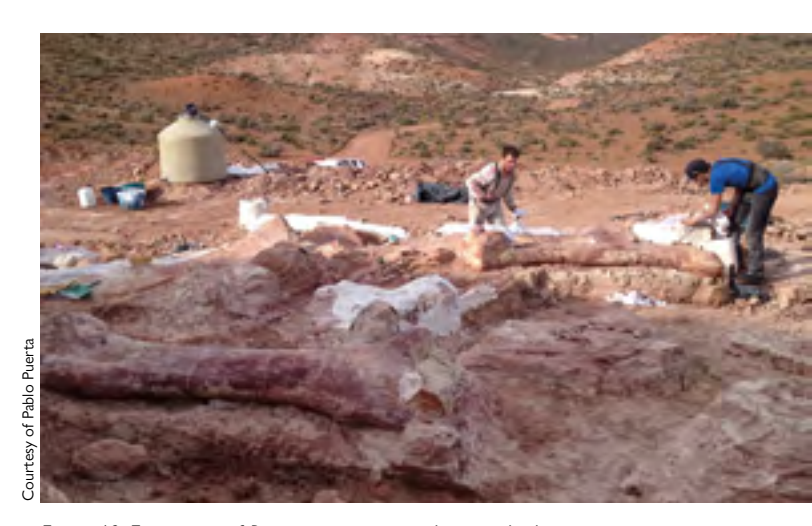
Figure 10. Excavation of Patagotitan mayorum showing the large bones found.

According to the femur or humerus length alone, we could make a mistake by saying that the longer the humerus or the longer the femur, the largest the sauropod would be. For instance, the Notocolossus