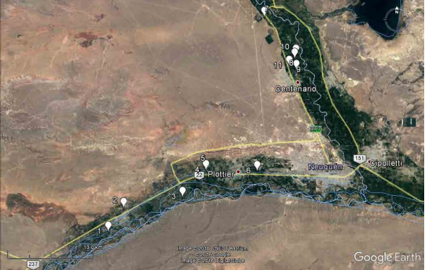
Fig.1. Map of groundwater monitoring sites in Neuquén province, Northern Patagonia, Argentina

area shows climatic characteristics such as low humidity, average annual precipitation below 250 mm, high sunshine and a prevailing west-east wind direction. These winds are stronger in spring and summer. The average temperature is 13.4 °C, with great thermal amplitude.